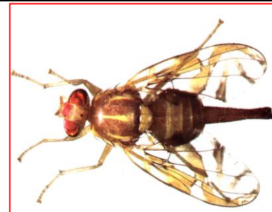
Fig 1. Adult Female: Anastrepha ludens (Gilbert et al. , 1984)

Adult: (Fig 1) Medium sized, yellow-brown. Mesonotum 2.75-3.6 mm long, yellow-brown, a slender median stripe widening posteriorly, humerus, a lateral stripe from transverse suture to scutellum, and scutellum pale yellow; frequently a diffuse brownish spot in middle of