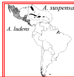
Fig 4. Distribution: A. ludens (Malavasi and Zucchi, 2000)

Central America: Mexico, Guatemala, El Salvador, Costa Rica (not of economic importance, Jiron et al. 1988), Nicaragua (Berg, 1979), Honduras (Hernández-Ortiz, 1993), Belize (Pollard, 1985).